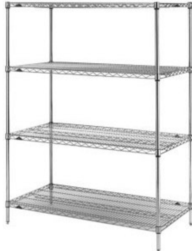
8 ea. EQ #2064, Wire Shelving Super Erecta #1872NC, 18"W x 72"D x 74"H + Metro #SASES25BP, Footplates

4 shelves shown in picture Provided unit will have 5 shelves as specified